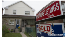
Financial Post Year in Review: Young homebuyers face tough financial choices