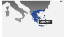
Five Ways the Grexit Could Happen