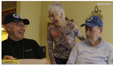
Retire happy – relax, it is not as bad as you think